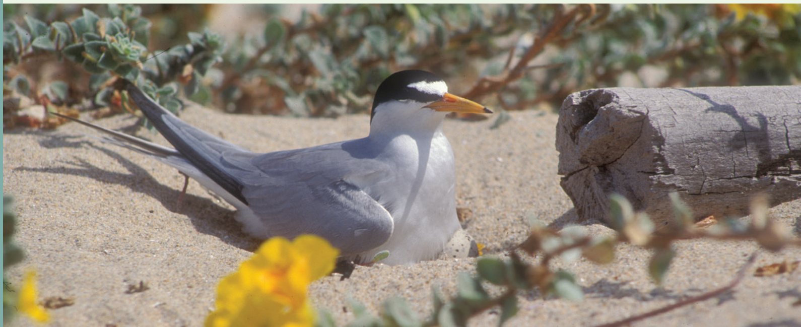
Photo below: Climatic changes, including sea-level rise and intensified coastal storms, may complicate installation efforts to manage threatened and endangered species such as the California least tern.

Cover: Heightened wildfire risks from climatic changes, such as warmer temperatures and prolonged drought, can result in restrictions on live-fire training and testing (Joint Base Elmendorf-Richardson).