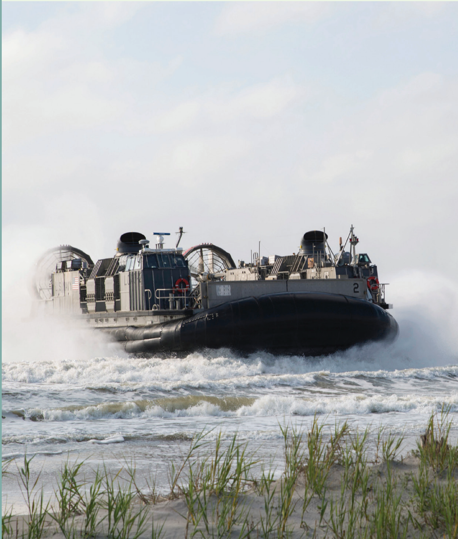
Rising sea levels and increasingly severe storms are among the climate-related risks to DoD natural resources that can affect the ability of installations to support training and testing (Marine Corps Base Camp Lejeune).