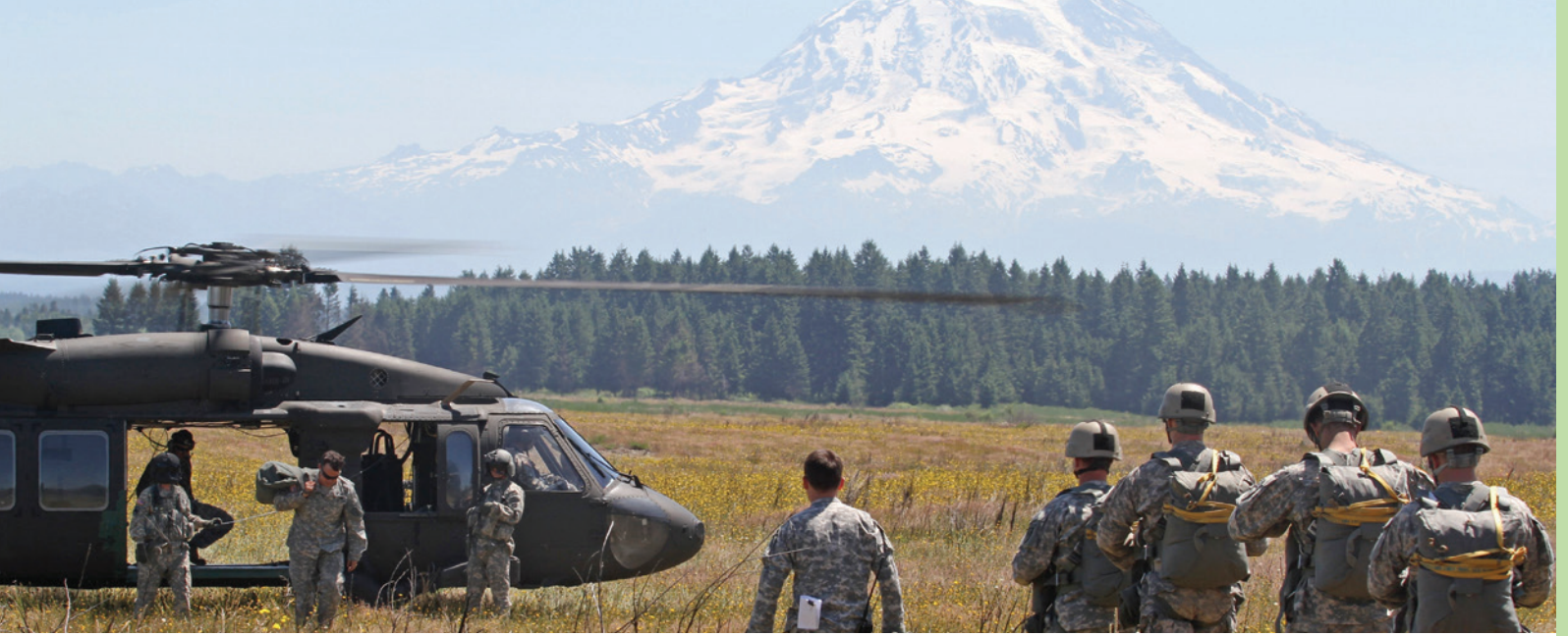
Adaptation planning can help installation natural resource managers prepare for and reduce climate vulnerabilities and risks.