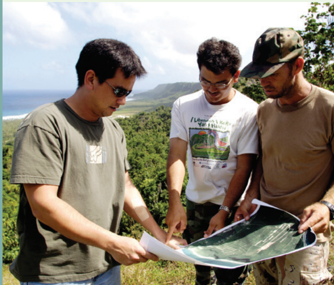
INRMPs are the foundational documents for installation natural resource management (Andersen Airforce Base, Guam).