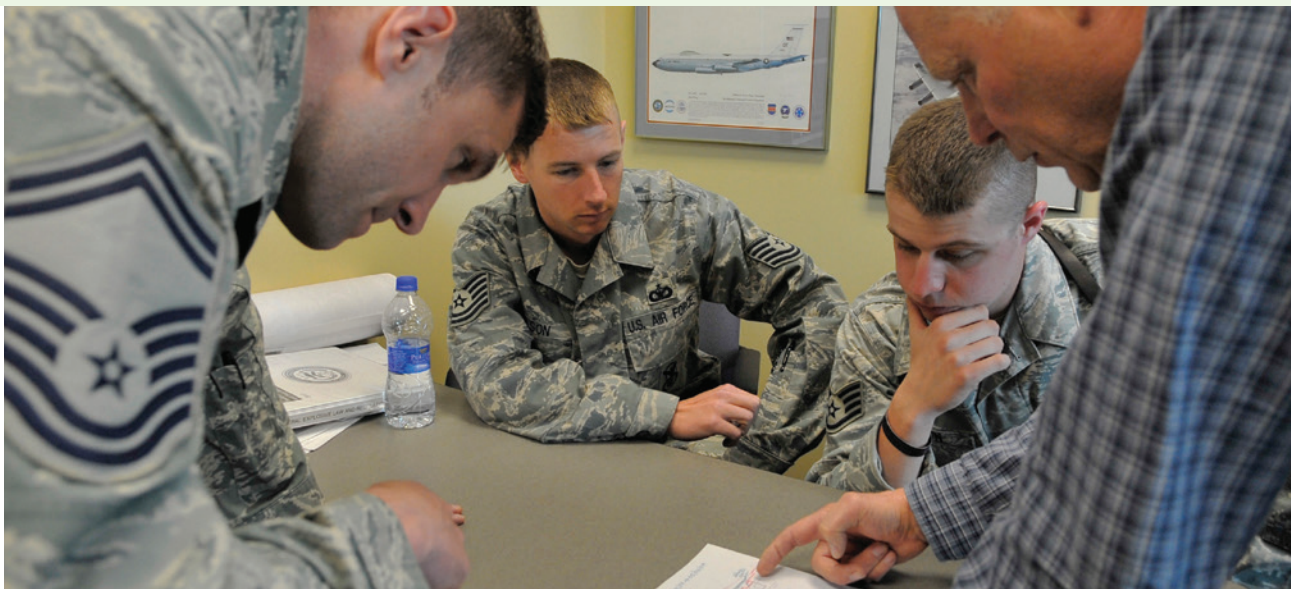
Asking the right questions is key to successful adaptation planning.