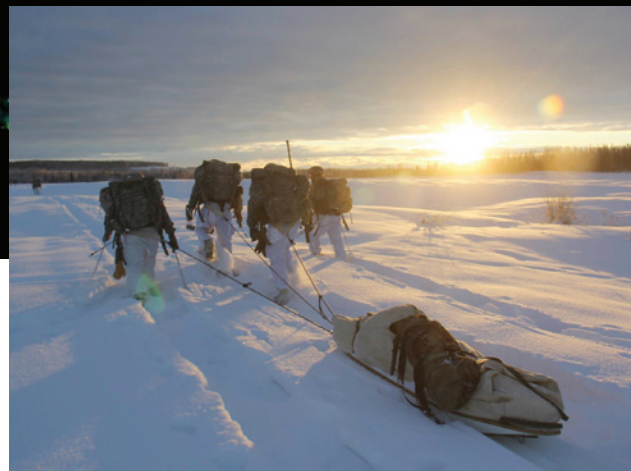
Rapidly melting permafrost in Alaska is transforming arctic ecosystems and destabilizing infrastructure and installation assets (Yukon Training Area, Fort Wainwright).