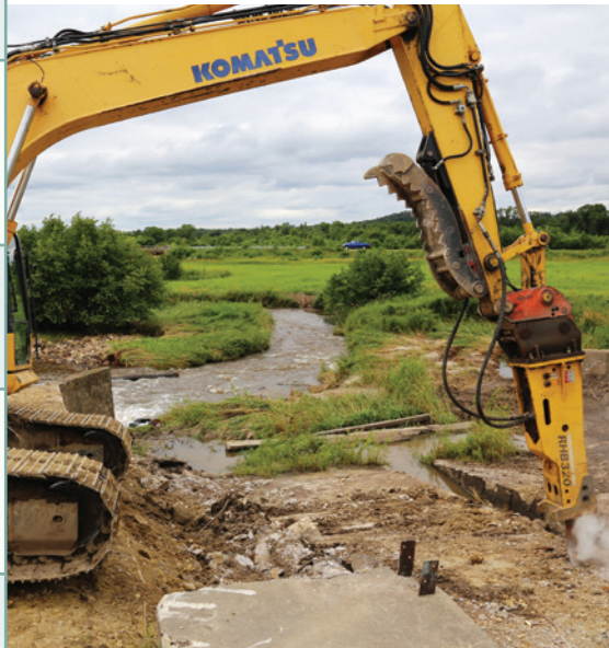
Modifications or refinements of existing INRMP projects may be needed to account for future climatic conditions (Fort McCoy).