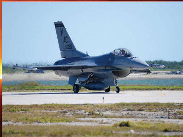
Rising sea levels pose a risk to operations and wildlife at low-lying installations such as Naval Air Station Key West.