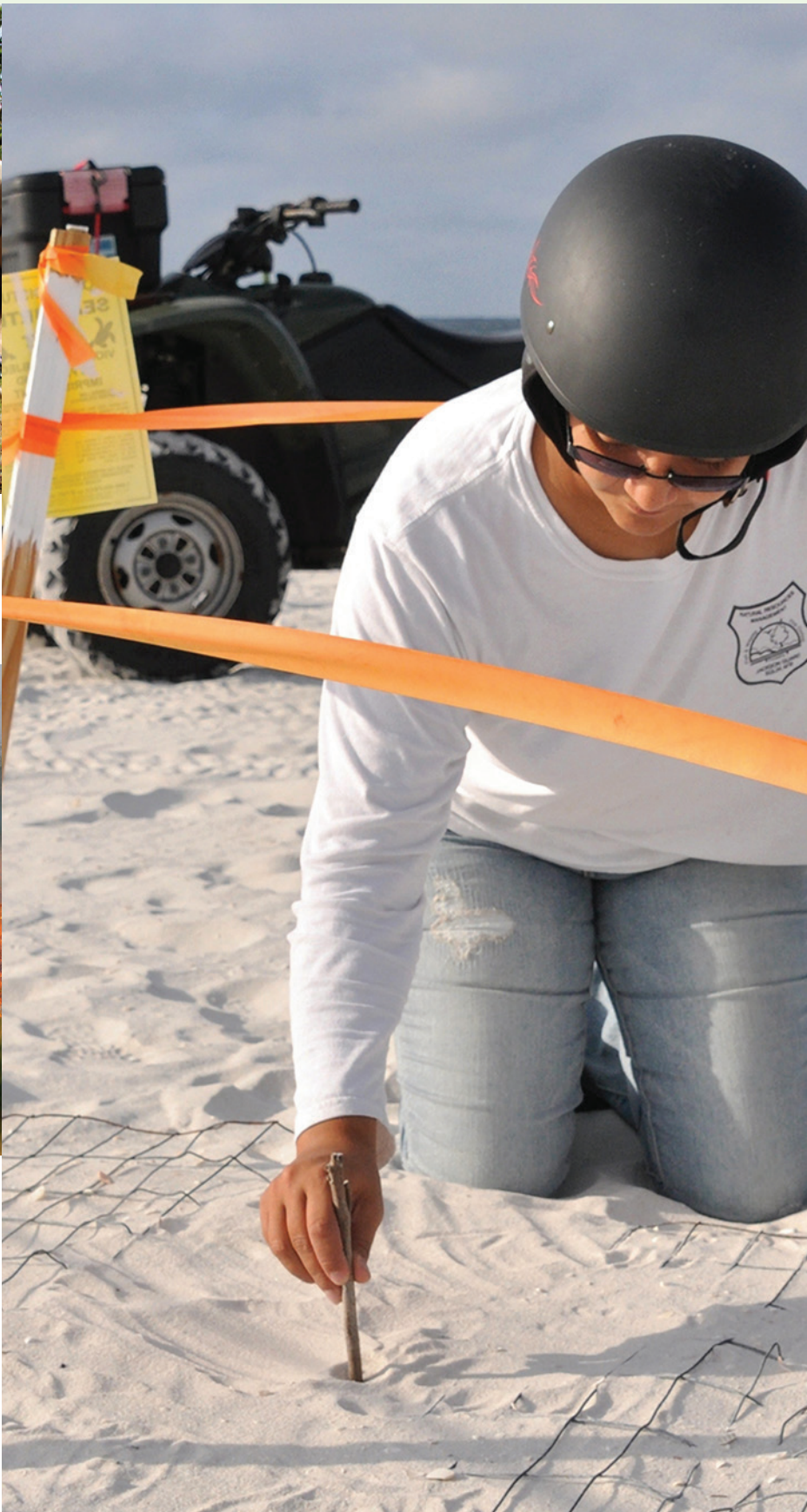
Warming temperatures and other climatic changes will increasingly affect DoD natural resource management efforts. The ratio of female to male sea turtle hatchlings, for example, is largely determined by sand temperature during incubation (Santa Rosa Island Range, Eglin Air Force Base).

Climatic changes already are disrupting key biological processes and can affect traditional land uses and management activities.