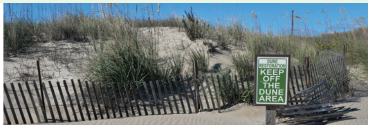
The INRMP adaptation planning process can highlight opportunities for natural systems to protect installation assets from climate-related risks (Naval Air Station Oceana).

The INRMP implementation table provides a concise summary and rationale for projects to be carried out under an approved INRMP and serves to inform installation programming and budgeting, including through the Program Objective Memorandum (POM) process. For this reason, ensuring that projects capable of reducing key climate risks are incorporated into the INRMP implementation table is a crucial outcome of the adaptation planning process.