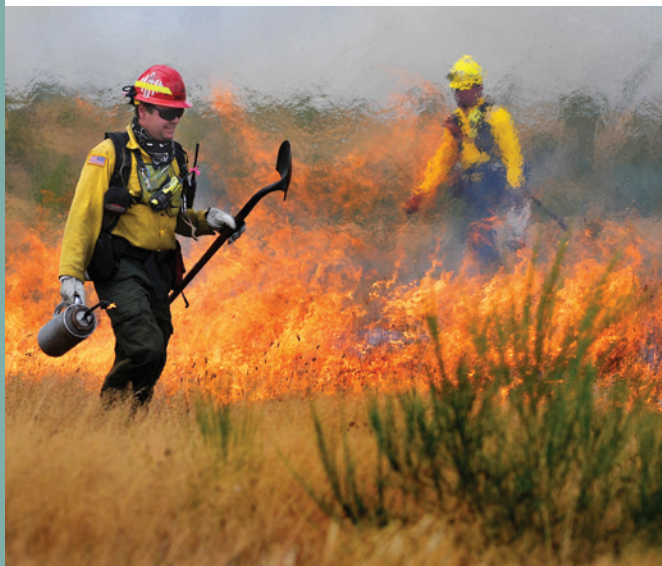
To reduce climatic risks, adaptation will often require proactive management, including expanded use of prescribed burns (Joint Base Lewis-McChord).

Climatic changes already are disrupting key biological processes and can affect traditional land uses and management activities.