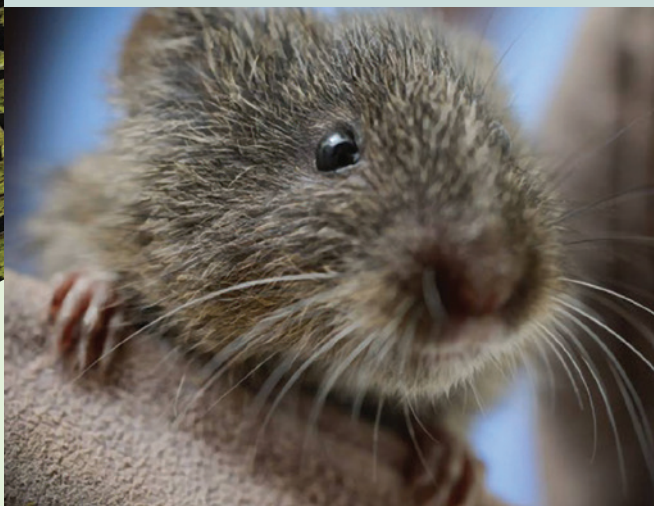
Amargosa vole.

Prolonged droughts diminish food and water resources for wildlife. Small and highly specialized animals, like the endangered Amargosa vole, are often unable to relocate or adapt to dry conditions and suffer as a result. 35 Amargosa voles—which currently number 500 or fewer in California—are completely dependent on bulrush marsh habitat in the Mojave Desert for shelter and their only food source. 36 Bulrush habitat declined by 37 percent during the recent drought in California, which was the state's worst dry spell in the last 1,200 years. 37 Elevated temperatures and exacerbated drought due to climate change are likely to continue to reduce and degrade vole habitat, threatening the recovery of the species.