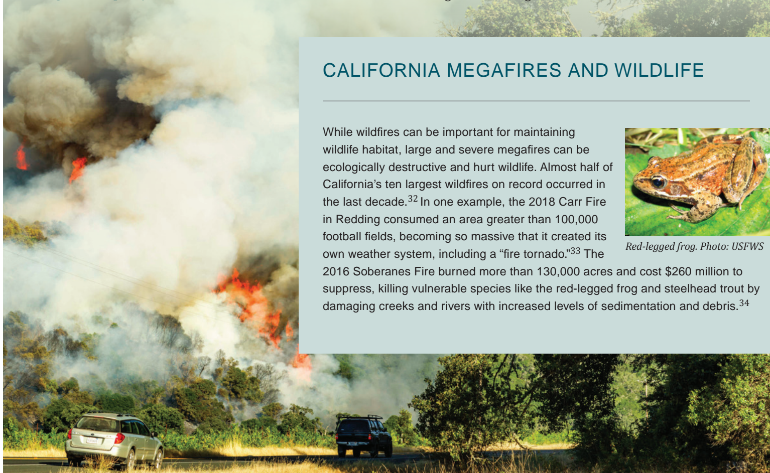
Mendocino County California fire.