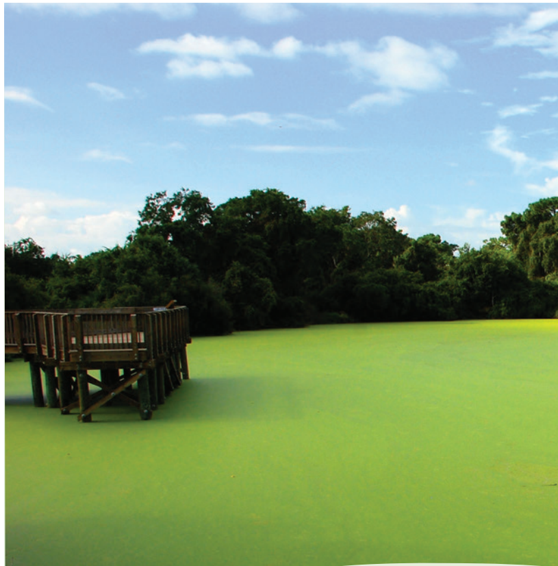
Blue-green algae bloom.