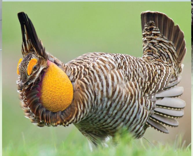
Prairie chicken.

Hurricane Harvey almost wiped out one of the world's most endangered birds—the Attwater's prairie chicken. The unique birds once numbered in the thousands across the coastal prairies of Texas and Louisiana, but severe declines from habitat loss have led to an endangered status. Further exacerbating these steep declines, two floods have decimated one of the remaining wild populations. The first disaster occurred during the flooding of Tax Day in 2016, followed closely by Hurricane Harvey in 2017. The flooding from the hurricane hit the Attwater Prairie Chicken National Wildlife Refuge and dropped the wild population down to just 12 birds. A captive breeding program provides short-term security for the birds, but frequent extreme weather events will make recovery of a wild population difficult.