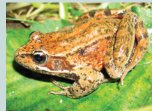
Red-legged frog.

While wildfires can be important for maintaining wildlife habitat, large and severe megafires can be ecologically destructive and hurt wildlife. Almost half of California’s ten largest wildfires on record occurred in the last decade. 32 In one example, the 2018 Carr Fire in Redding consumed an area greater than 100,000 football fields, becoming so massive that it created its own weather system, including a “fire tornado.” 33 The 2016 Soberanes Fire burned more than 130,000 acres and cost $260 million to suppress, killing vulnerable species like the red-legged frog and steelhead trout by damaging creeks and rivers with increased levels of sedimentation and debris. 34