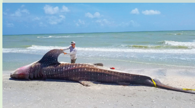
Biologist performs a necropsy on a whale shark that died during a red tide event.

In 2007, researchers studied approximately one dozen dead or dying sea otters that had been reported in California. 26 These deaths were determined to be the result of a toxin found in blue-green algae that concentrated in a freshwater lake and washed out into the ocean. This toxin most likely became concentrated in the otter’s favorite food source, shellfish. Poisoned shellfish are also a problem for people and local shellfishing economies, as contaminated shellfish pose health risks and cannot be sold for consumption. In New England, a 2016 red tide event cost the shellfish industry $12 to $20 million in Massachusetts alone. 27