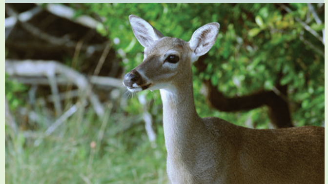
Key deer.

Rare island species are especially vulnerable to the impacts of climate change, due to direct storm hazards, major habitat damage, and/or food web changes. There are approximately 20 endangered species in the Florida Keys, and many of them are found nowhere else in the world. One subspecies is the Key deer—the smallest deer in North America. According to a U.S. Fish and Wildlife Service (USFWS) survey, 14 to 22 percent of the Key deer population (which is estimated to be about 1,000 deer) was killed by Hurricane Irma. 23