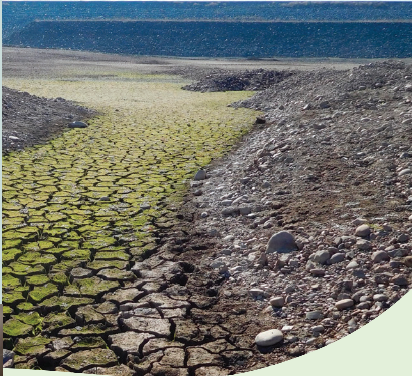
Drought at Folsom Lake, California, 2015.

Ecosystems, and the wildlife that depends on them, will experience a variety of impacts as droughts become more frequent and severe. Drought can lead to increases in