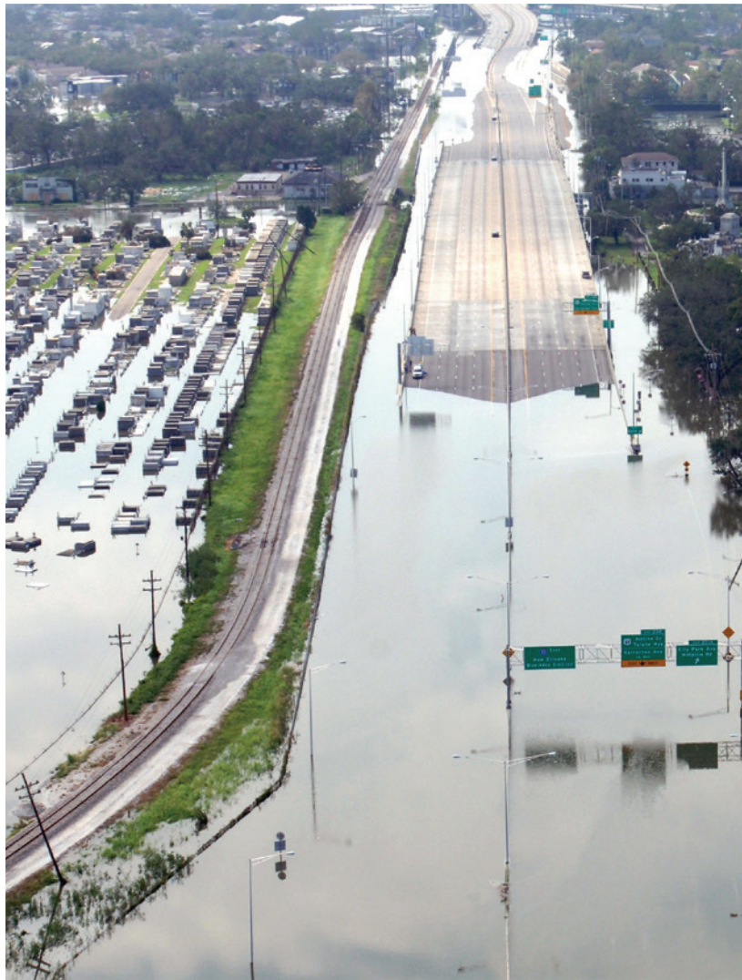
After Hurricane Katrina, 2005.